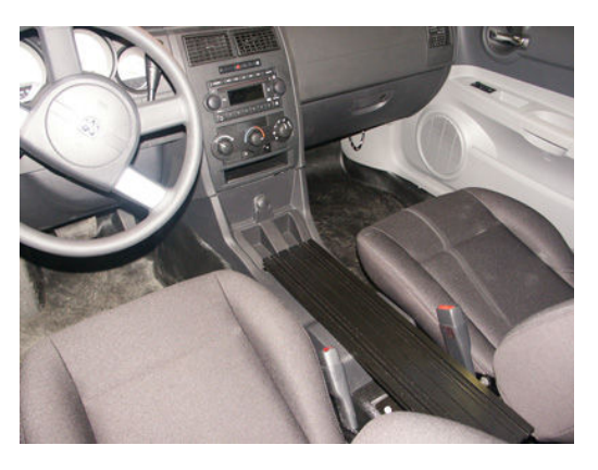
Remove OEM supplied trak. <u>Note: Some hardware is re-used</u> in installation of console